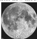
Full Moon about 15 days after new moon