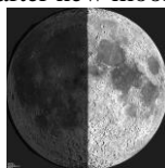
Waxing Half Moon about 7–8 days after new moon