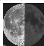
Waning Half Moon about 21–23 days after new moon